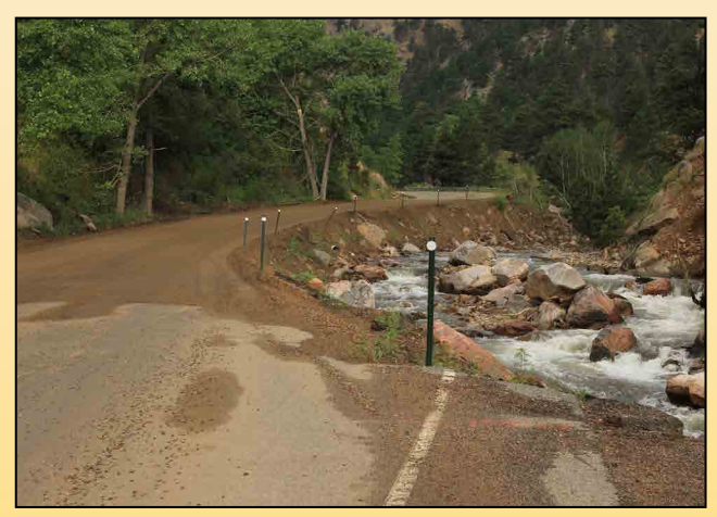
Lefthand Canyon, July 2014

BE ON THE LOOKOUT! During the flood recovery, certain roads may experience higher traffic volumes from both bicycles and motor vehicles as other roads are closed while being repaired. Roads may also become narrower in places even while the temporary paving is in place. Expect the unexpected and use caution!