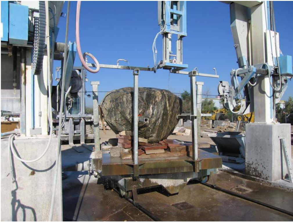
Stone cutting, Spring 2007