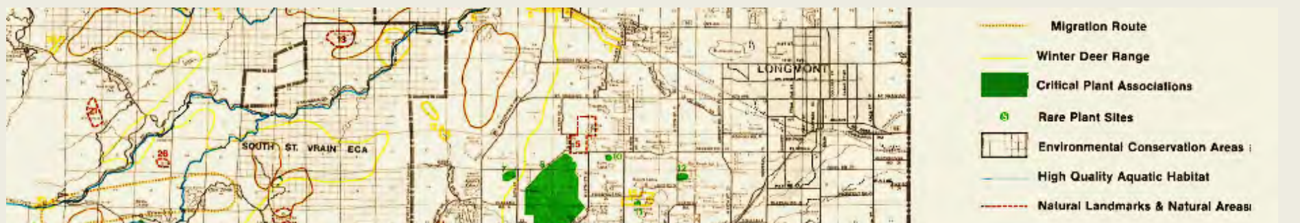
Environmental Resources map from 1986 Plan

1983-1986: Environmental Resources Element created to provide an in-depth analysis of the important natural and cultural resources in the county