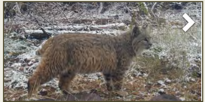
Bobcat at Heil Valley Ranch