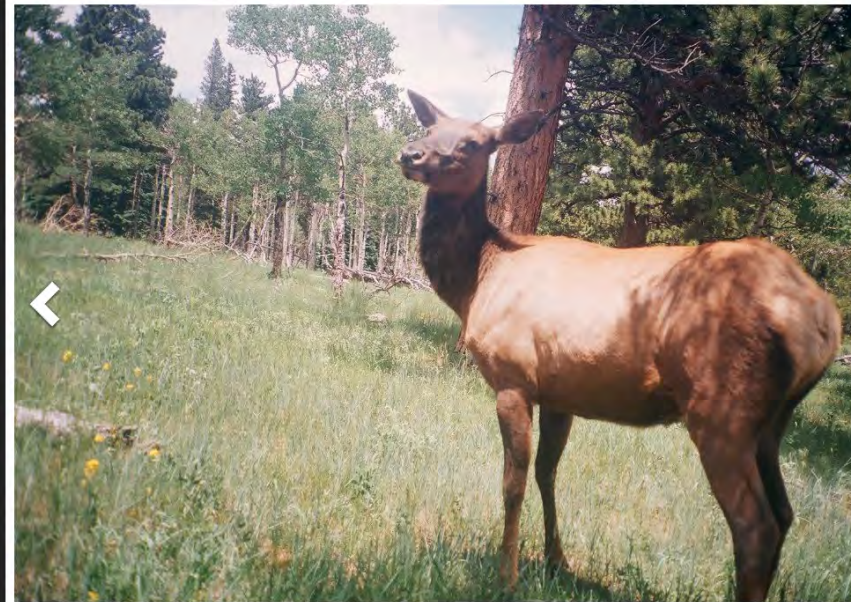
Cow Elk at Caribou Ranch

Boulder County recognizes that climate change is having significant impacts on our environmental resources. As the body of climate science knowledge grows and potential effects (e.g., increasingly severe weather and increased fire and flood frequency) are better understood, Boulder County shall modify plans and policies to adapt to environmental changes and to reduce potential adverse impacts on environmental resources.