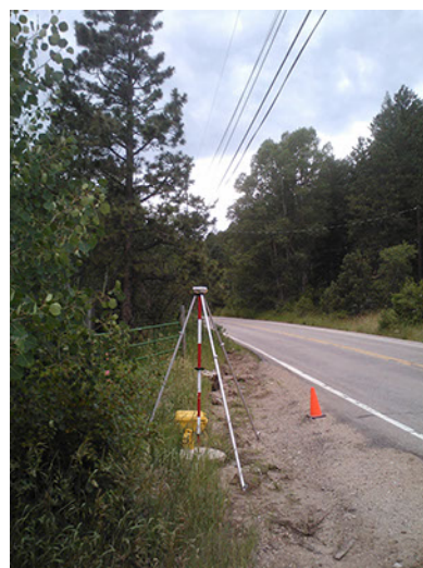
Boulder 100 area