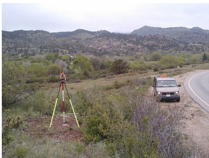
LYONS AZ MARK area