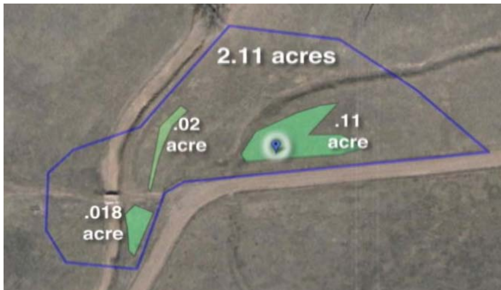
Trial pasture boundaries and knapweed patches. Circle marks molasses tub location.

On the eighth day the cows rested while we built fence for their trial pastures. A good trial pasture is small enough so that cows can't just eat the best and leave the rest. It also has plenty of variety so they don't have to eat just the target weed. Our trial pasture was 2.11 acres. It included grasses, mullein, thistles a variety of forbs and several large diffuse knapweed patches; enough forage for three days. That afternoon we lured the cows into the trial pasture by feeding them grain.