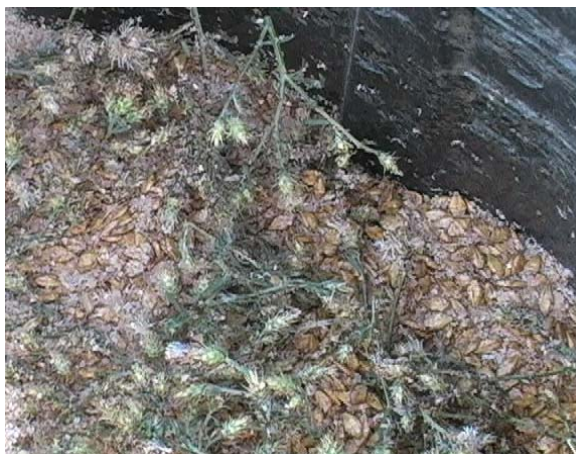
Example of what they ate

Typically, the first time I feed weeds there is a lot more milling about, and these heifers were no exception. It is also typical that not all weeds are eaten immediately as was the case here.