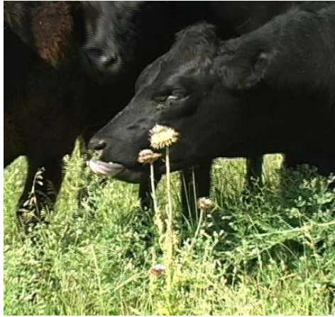
Cows graze diffuse knapweed in trial pasture and an example of a grazed knapweed plant

At about 10:00 on the morning of the 11 th day we moved the heifers across the road to a 40 acre pasture on the Mayhoffer/Singletree property where they continued to eat knapweed.