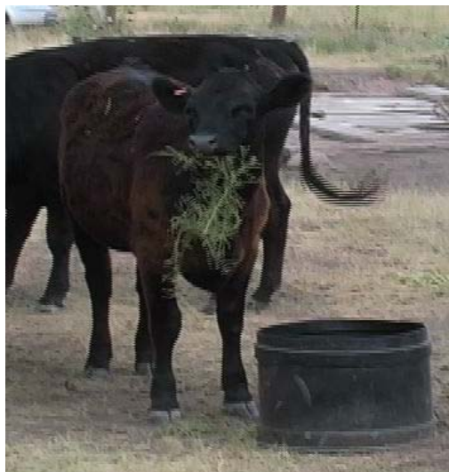
Heifer eats plain knapweed from tub on Day 7