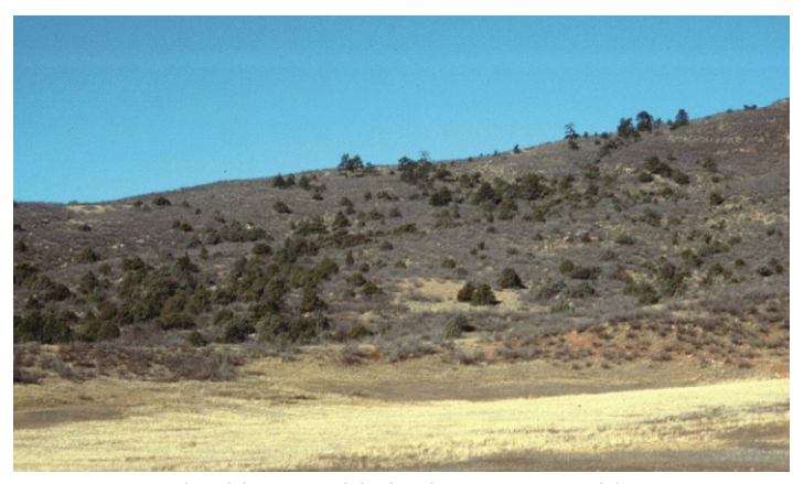
Fuel Model 5 (T): Mixed shrubs

This type includes most mountain shrub communities, such as mountain mahogany, wax currant, bitterbrush, and buckbrush. Montane grasses and forbs are associated with this type.