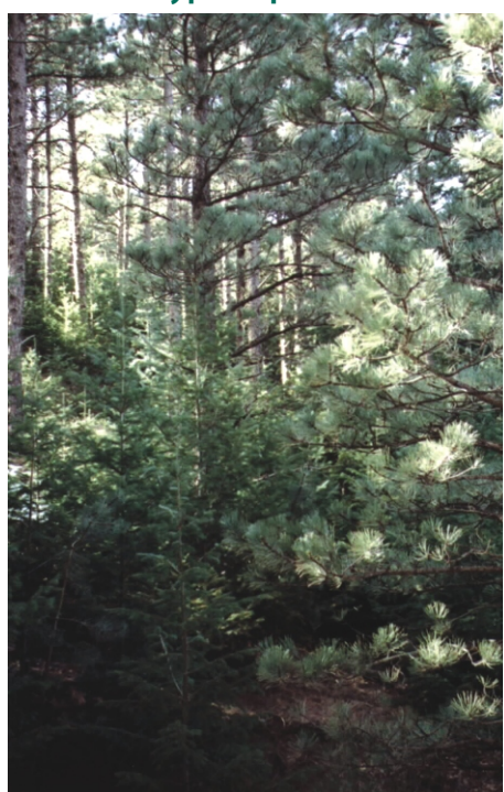
Fuel Model 4 (B): Doghair pine stands

Tress that commonly associated with this model are ponderosa and lodgepole pine. Shrubs such as common juniper and Oregon grape may be present. Few grasses and forbs are present due to heavy shading.