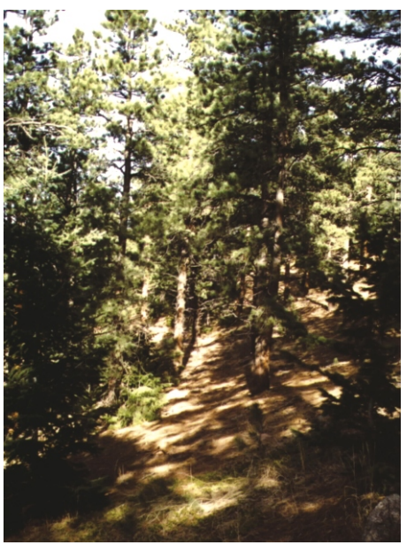
Fuel Model 9 (U): Closed canopy mixed conifer.

This model can include ponderosa pine, lodgepole pine, and a mixture of Douglas-fir, Engelmann spruce and limber pine. Some mountain shrubs and grasses are present in scattered locations. Few grasses are present due to heavy shading.