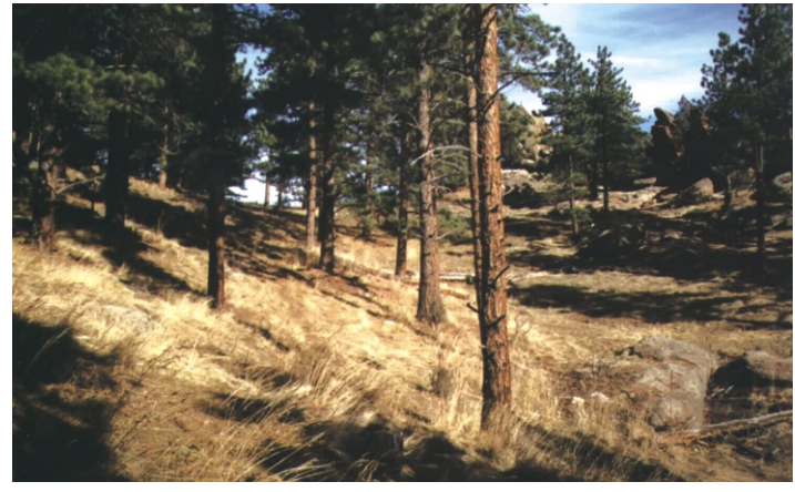
Fuel Model 2 (C): Grasses with Downed Stemwood

This fuel model consists of open grown pine stands. Trees are widely spaced with few understory shrubs or tree regeneration. Ground cover is moderate and consists of grasses and/or needles and small woody litter. This model occurs as open-grown, mature ponderosa pine stands in the foothills to upper montane zone.