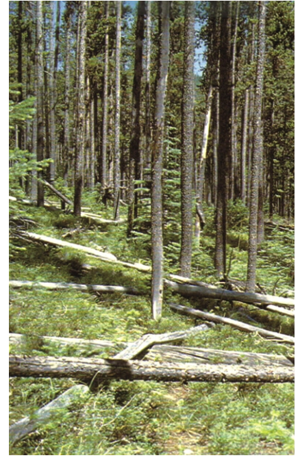
Fuel Model 8 (H): Closed canopy pine

Fires are generally be slow burning, low intensity events, mainly consuming in the surface fuels, needle cast and woody litter. Fires are dangerous mainly in scattered areas where accumulations of down woody materials can cause tree torching and spotting.