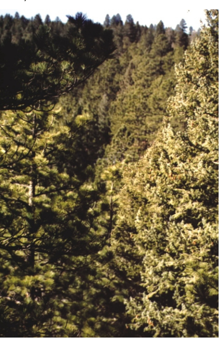
Fuel Model 10 (G): Closed canopy pine

Fires tend to be moderate to high intensity events, in part due to the density of the tree canopy and the amounts of dead, down woody material. Torching and spotting of fires is frequent, and high intensity fires can occur and have the potential to develop into stand-replacing events.