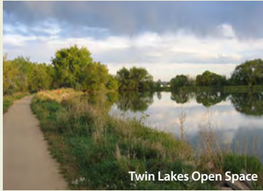
Twin Lakes Open Space