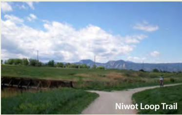
Niwot Loop Trail