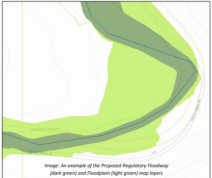
Image: An example of the Proposed Regulatory Floodway (dark green) and Floodplain (light green) map layers