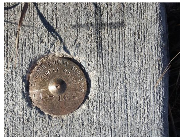
LL 16-B Benchmark (above), Landmark photo (left), Looking North