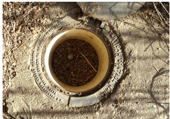
W-413 Benchmark (above left), Landmark photo, looking North (above right).