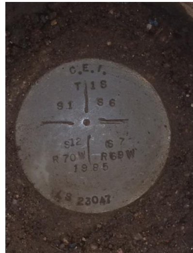
(SW Corner S6 T1S R69W) Benchmark (above Right) City of Louisville Benchmark, LP-17, Landmark photo, looking west (above left).