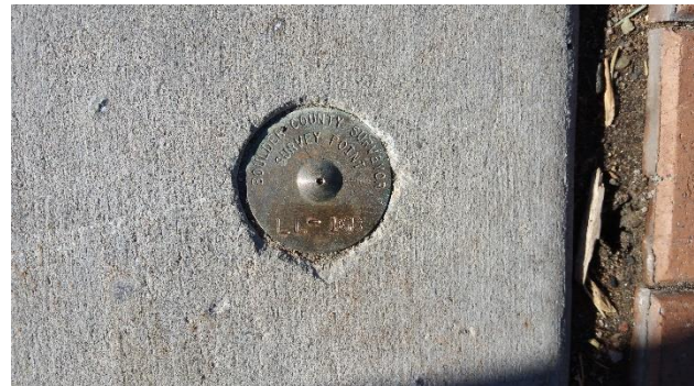
LL-16D Benchmark (above), Landmark photo (left), looking North