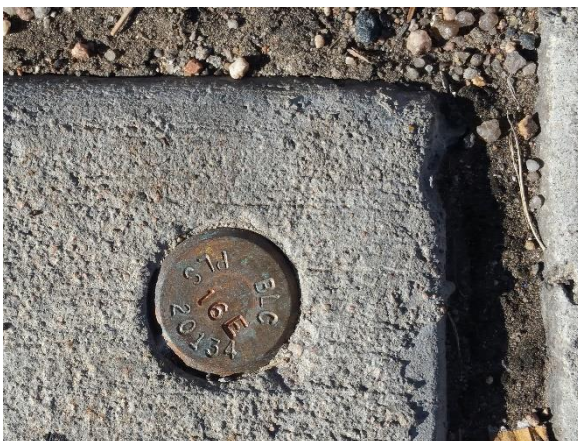
LL-16E Benchmark (above), Landmark Photo (right), Looking Southwest.