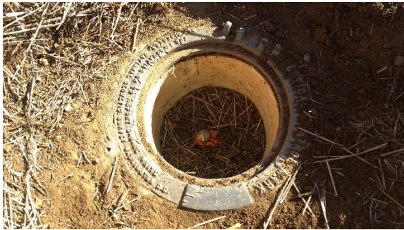
Q-413 Benchmark (above), landmark photo (right), looking North