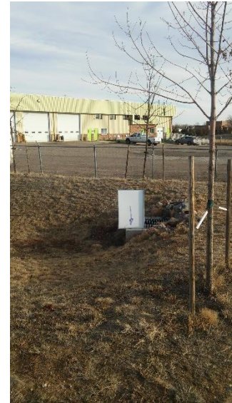
LL-16C Benchmark (above), Landmark photo (right), Looking Northeast