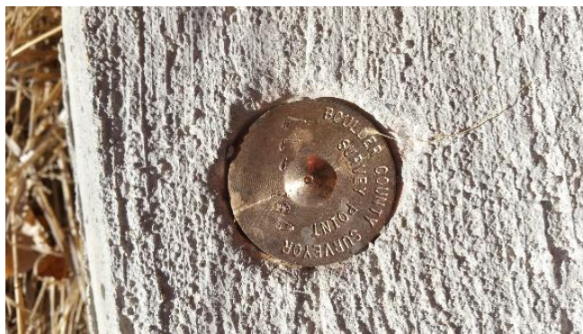
LL-16A Benchmark (above) landmark photo (right), Looking Northeast