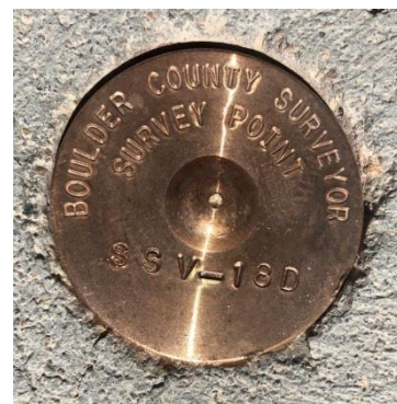
SSV-18D Benchmark (above). Landmark photo, looking South (left).