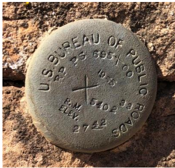
US Bureau of Public roads RP PS 695+00 (above) Landmark photo (right), Looking Southeast