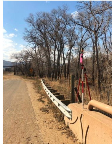
SV-13C Benchmark (above), Landmark photo (right), Looking Northwest