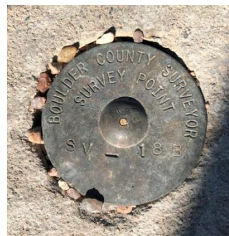
SV-18B Benchmark (above), Landmark photo (left), looking West.