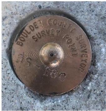
BS-18C Benchmark (above), Landmark photo (right), Looking West