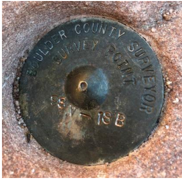
SSV-18B Benchmark (above), Landmark Photo (right), Looking South.