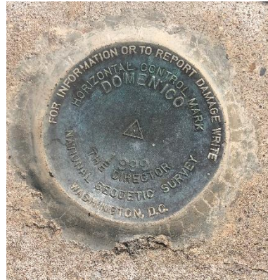
DOMENICO (NGS PID A13559) Benchmark (above). Landmark photo, looking North (left).