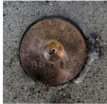
BS-18B Benchmark (above - right). Landmark photo, looking East (above - left).