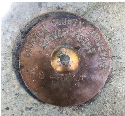
BS-18A Benchmark (above), Landmark photo (right), Looking Northwest Landmark photo (below), Looking West