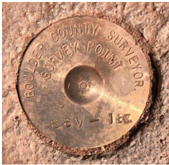
SSV-18C Benchmark (above) Landmark photo, looking Northwest (right).