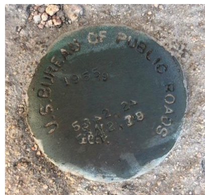
US Bureau of Public Roads 5342._9 (right) Landmark photo (above), Looking South