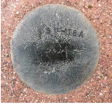
SSV-18A Benchmark (above), Landmark photo (right), Looking East