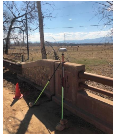
SV-18C Benchmark (above), Landmark Photo (right), Looking Southwest.