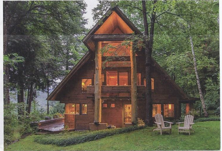
Upper Pines Lodge - Warren, VT

In July 2018, Vacasa launched Vacasa Real Estate to help connect vacation home buyers and sellers with local agents. With access to rental performance data, a steady stream of buyer leads, and the largest inventory of vacation homes in the country, the company is uniquely positioned to streamline the process of buying and selling investment properties—and to simplify the experience of renting them out.