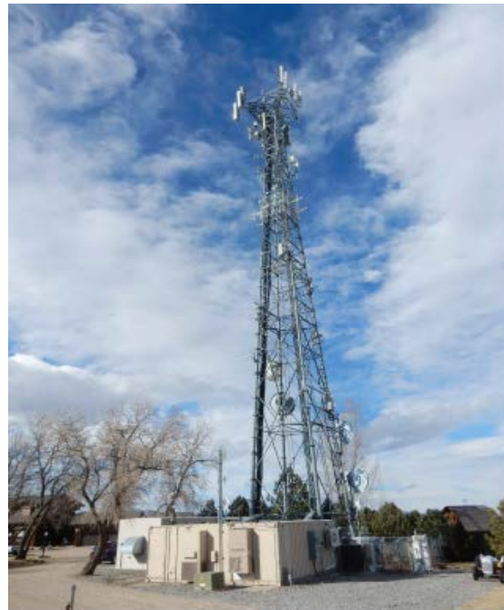
EXTERIOR VIEW: TOWER 2 A1 SCALE IN FEET