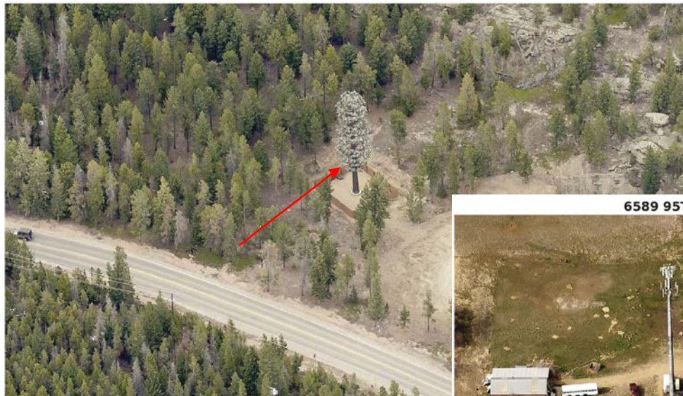
6589 95TH ST