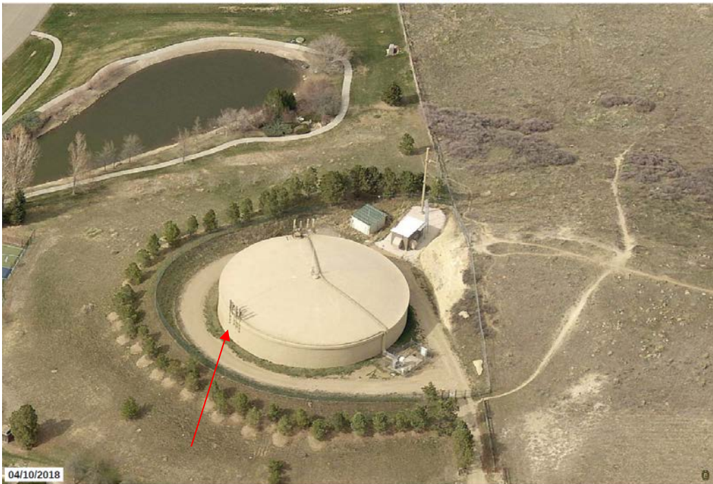
Figure 3. Antenna Structures on Building and separate structure at 7493 Old Mill Trail