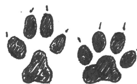
Dog paw prints