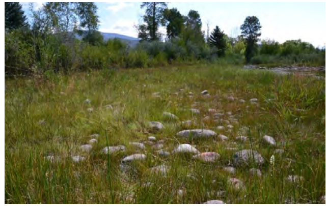
Ute Ladies'-Tresses ( Spiranthes diluvialis ) habitat.