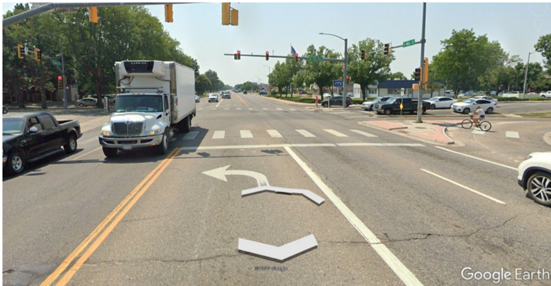
View on US-287/Main Street, looking south toward proposed underpass south of intersection