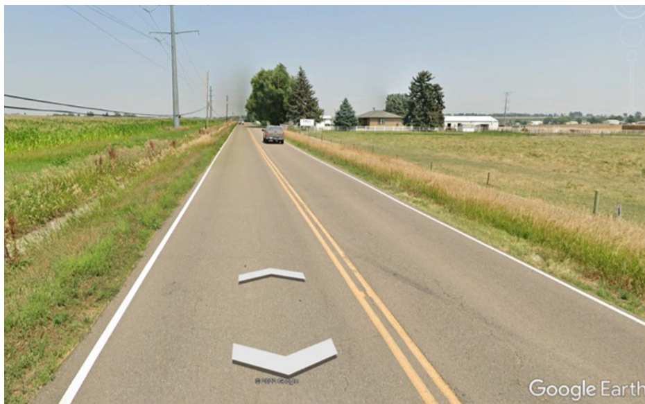
View on County Line Rd looking north from 17 th Ave*

*note that the field on the left/west is planned to be a community park in the next 5 years.