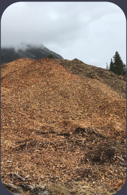
Pile of wood chips at the Meeker Park CFSY.