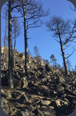
Lichen Loop Project post Cal-Wood Fire

Immediate recovery efforts concentrated on felling fire weakened trees at certain locations on Heil Valley Ranch. Forestry operations performed hazard tree mitigation from December 2020 through April 2021, focusing on the northern trails system, main parking lot, and main access road. These efforts expedited the opening of several trails, allowed for the safety of others working on recovery efforts, and provided on-site material for use in aerial mulching operations.