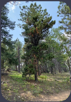
Ponderosa pine with heavy dwarf mistletoe infestation at Caribou/Sherwood

In 2021 our forestry planning group completed a forest inventory of 82 data plots, spanning approximately 1,556 acres. At Walker Ranch, 60 plots were collected over areas of both forest and grassland. The data collected at Walker Ranch is pre-treatment, setting the informational basis for future prescription burns in the area. The data for the remaining 22 plots were collected from the forested area behind the Nederland Community Forestry Sort Yard (CFSY), allowing us to draft a forestry recommendations and prescription report for the 34 acre parcel.