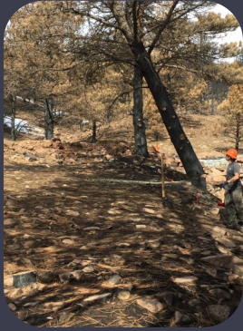
Hazard tree felling at Heil Valley Ranch main trailhead