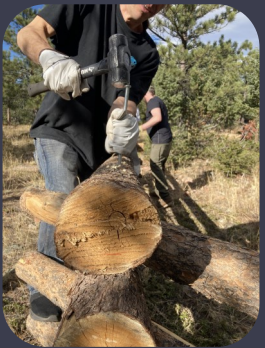
Volunteers help rebuild fences at Heil Valley Ranch