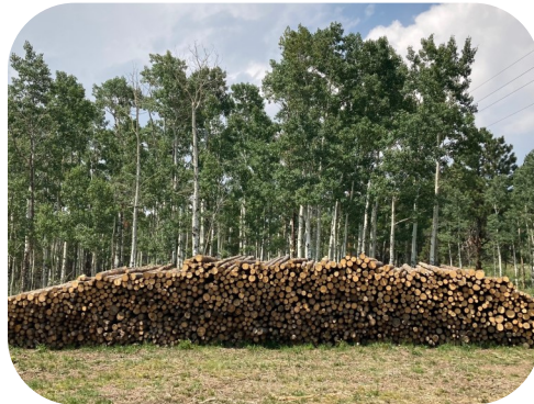
Firewood deck at Reynolds Ranch

Work continued at Reynolds with an additional 1.5 acres of patch cuts completed in 2021.