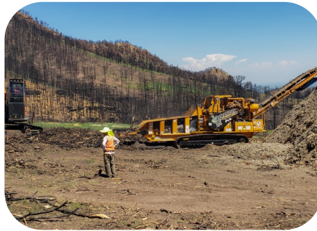
Grinding operations at Landing 3

Forestry aided in additional recovery efforts by overseeing the harvesting and grinding portions of the aerial mulching contract. Duties included identifying appropriate landings, locating areas to harvest trees for mulch production, daily on-site presence to monitor equipment operators, and providing guidance for similar work being performed at the Cal-Wood Education Center.