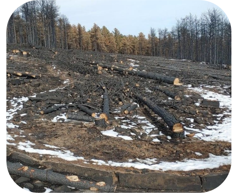
Hazard tree work-Wild Turkey Trail