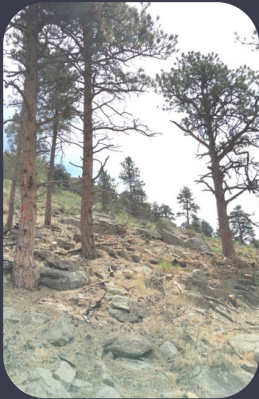
Lichen Loop Project post-treatment