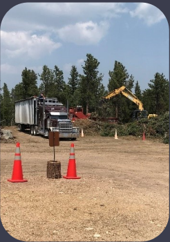
Grinding operations at the Nederland CFSY