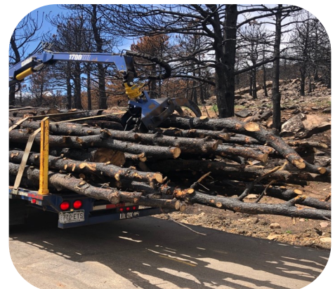
Ox load being hauled from Mountain View