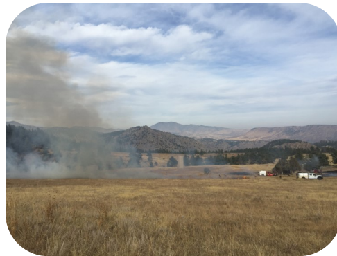
Prescribed fire at Hall Ranch

On November 9, with the cooperation of the Boulder County Sheriff's Office, a controlled burn of 27 acres was performed along the Nelson Loop at Hall Ranch. This burn was intended to set the basis for continued prescribed burns in the area as a means to reduce fuel loads and combat encroaching noxious weeds.