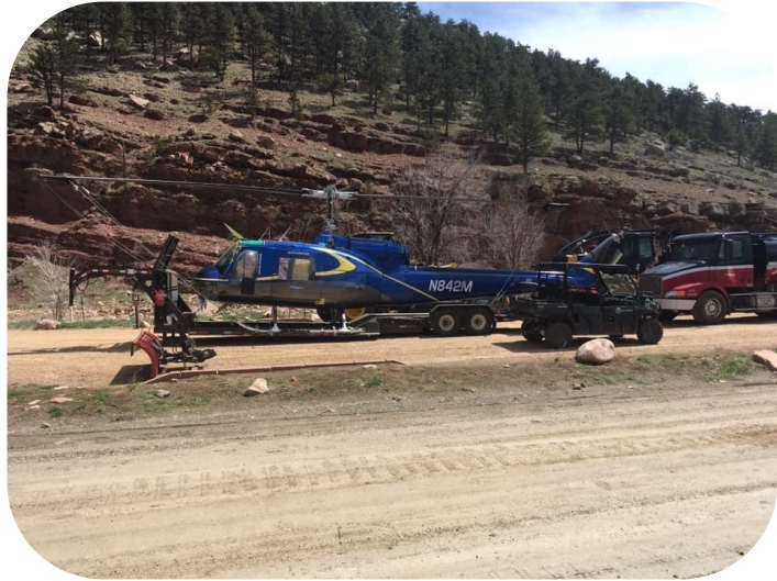
UH-1 Huey used for aerial mulching at Heil Valley Ranch

Website: https://www.bouldercounty.org/open-space/management/forestry/