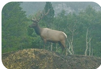
Meeker Park's resident elk (shown left), and CFSY collected noxious weeds (shown right).