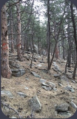
Lichen Loop Project pre-treatment