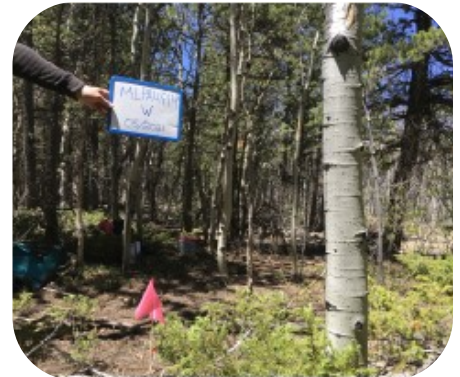
Data photopoint at the Nederland CFSY

In 2021 our forestry planning group completed a forest inventory of 82 data plots, spanning approximately 1,556 acres. At Walker Ranch, 60 plots were collected over areas of both forest and grassland. The data collected at Walker Ranch is pre-treatment, setting the informational basis for future prescription burns in the area. The data for the remaining 22 plots were collected from the forested area behind the Nederland Community Forestry Sort Yard (CFSY), allowing us to draft a forestry recommendations and prescription report for the 34 acre parcel.