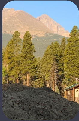
View looking west from the Meeker Park CFSY

Outreach is an important part of the CFSY program. Unfortunately, many of our outreach events, such as user appreciation days and wildfire awareness days, were canceled because of COVID-19. We were able to continue providing education and outreach materials at our yards for visitors, including our monthly newsletter, and we also used social media to communicate with the public.