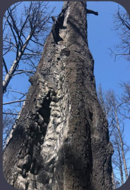
One of many fire weakened trees in the post-fire areas at Heil Valley Ranch

Our operations crew spent the first three months of 2021 at Heil contributing match hours towards the Lichen Loop pre-disaster mitigation grant, as well as general hazard tree felling.