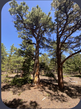
Legacy trees that will be retained during the Caribou/Sherwood project