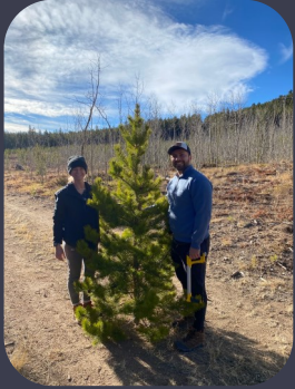
Holiday tree permit holders find a great tree and help thin high density lodgepole regeneration