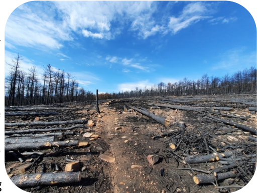
Hazard tree work-Wild Turkey Trail

Immediate recovery efforts concentrated on felling fire weakened trees at certain locations on Heil Valley Ranch. Forestry operations performed hazard tree mitigation from December 2020 through April 2021, focusing on the northern trails system, main parking lot, and main access road. These efforts expedited the opening of several trails, allowed for the safety of others working on recovery efforts, and provided on-site material for use in aerial mulching operations.