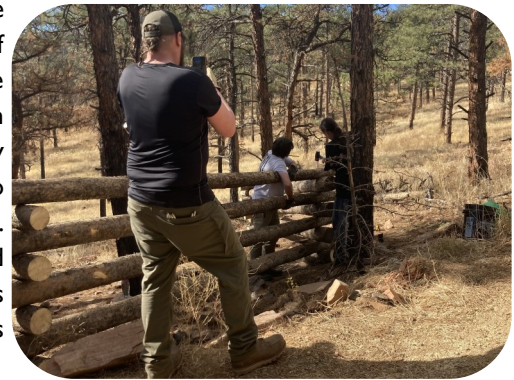
Volunteers replacing worm fence at Heil

Volunteers also took part in post-fire activities by rebuilding multiple sections of worm fence that were consumed during the fire. Forestry operations played a key role in making these work projects happen by delivering over 500 fence rails to two different locations at Heil Valley Ranch. In all, volunteers were able to rebuild over 1,000 feet of fence at locations ranging from the entrance gate to access gate 4.