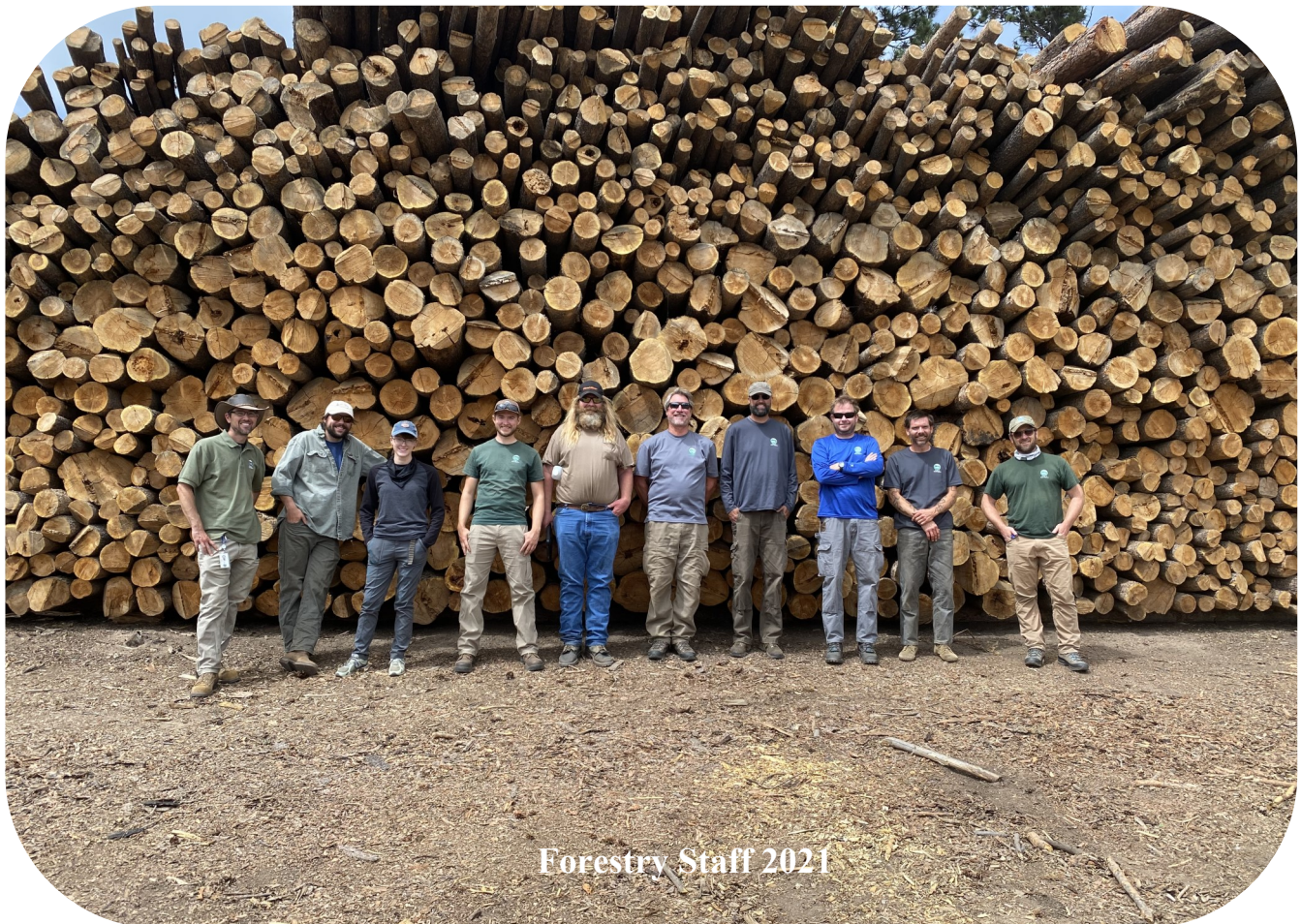
Forestry Staff 2021