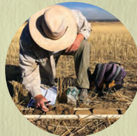
Healthy Land and Water for a Healthy Community PAGE 10