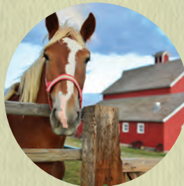
Connecting with History PAGES 8-9