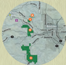
Parks & Museums Map PAGES 6-7