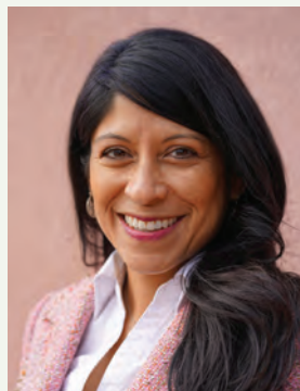
Commissioner Marta Loachamin