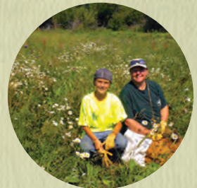
Get Involved PAGE 11