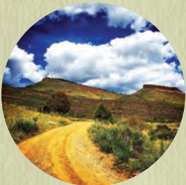
Outdoor Fun for the Whole Family PAGES 4-5