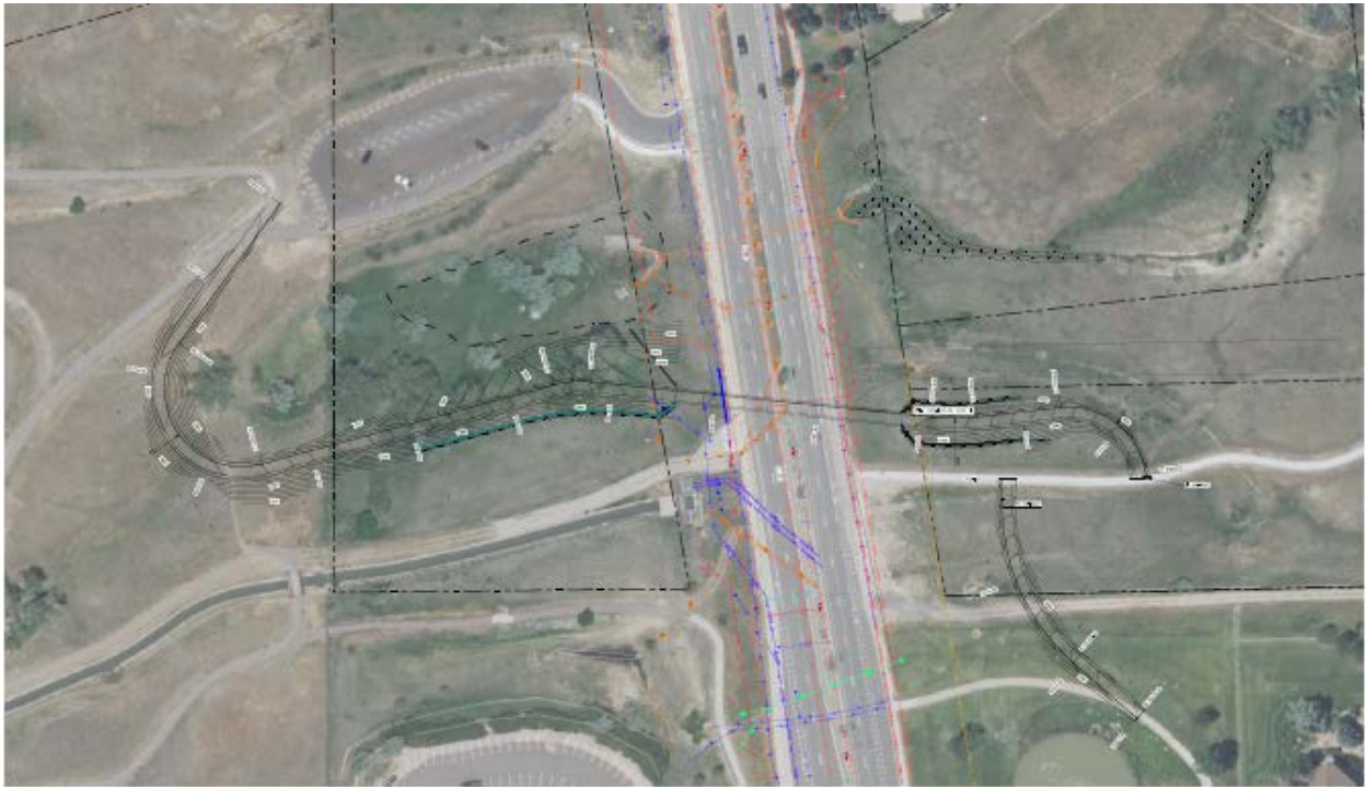
McCaslin Blvd Underpass/Trail Plan View