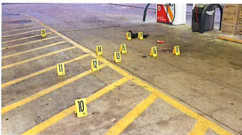
Photograph showing the evidence markers documenting the cartridges collected by the BCIT. Markers 10-16 and 19-20 show the locations of cartridges from Officer Fender's weapon.

Fender struck the rear of the vehicle. A later analysis of the trajectory of the rounds that entered the vehicle confirmed that none of these rounds actually struck Mr. Huiras, which was consistent with the single, self-inflicted gunshot wound noted at autopsy.