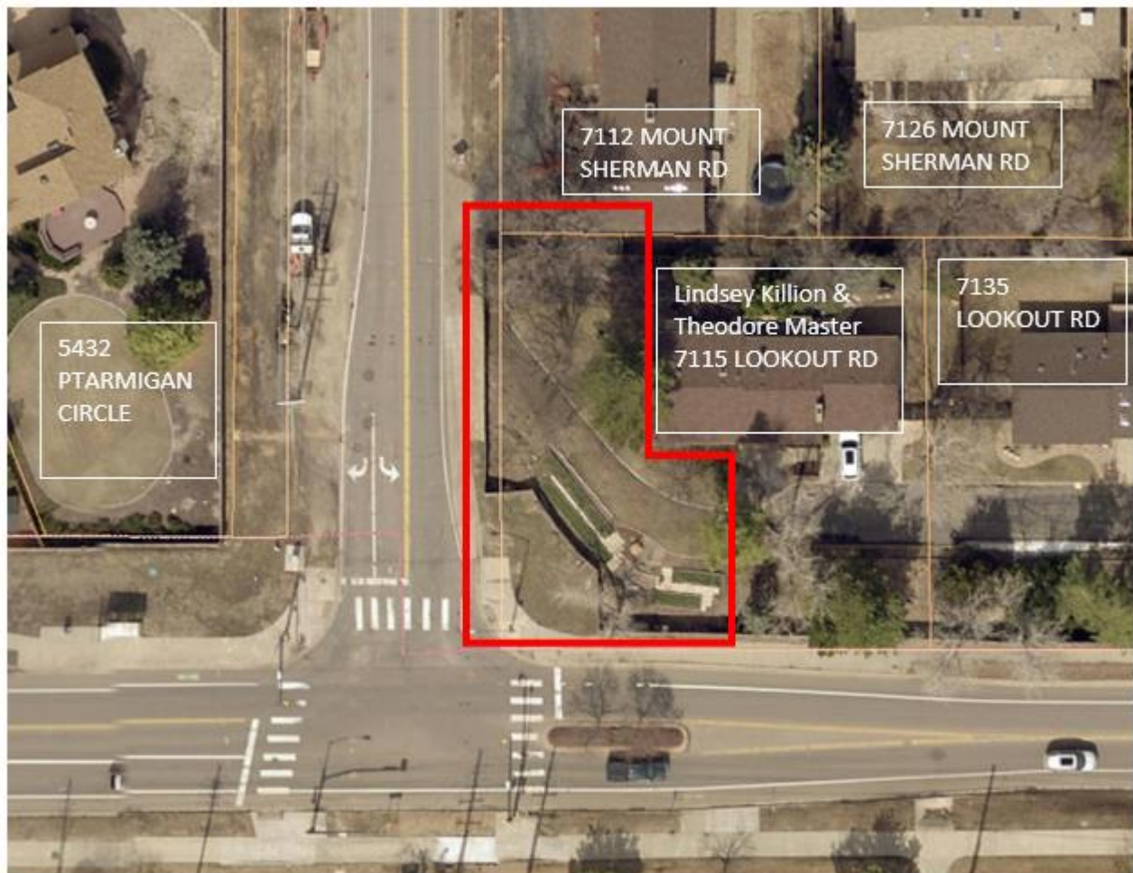
Figure 1: Northeast Corner of 71 st St. and Lookout – Survey Extents