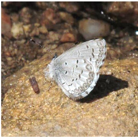
Echo Azure Greg Muench