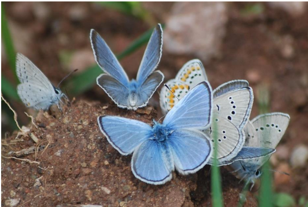
Echo Azure (left) Greenish Blue (middle back) Melissa Blue (back, center right)

Both of the above species were numerous at Reynold's Ranch