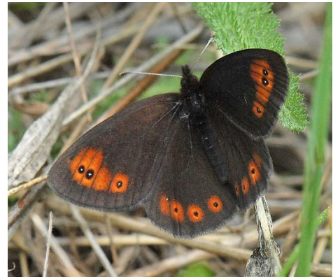
Common Alpine

Both of the above species were numerous at Reynold's Ranch