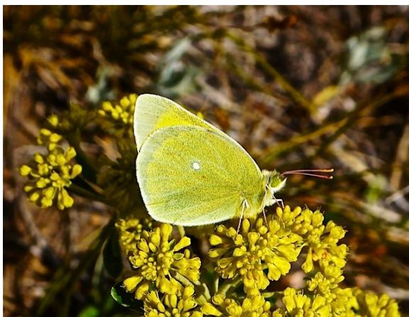
Queen Alexandra's Sulphur

Both Azure and Wood Nymph numerous at Walker Ranch