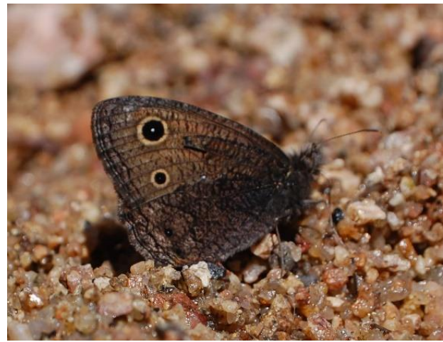
Small Wood Nymph Dan Fosco

Both Azure and Wood Nymph numerous at Walker Ranch