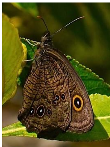
Common Wood Nymph