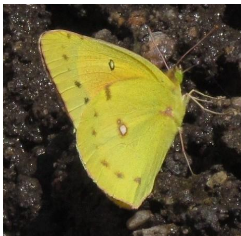
Orange Sulphur

Most numerous butterfly in 2016; common in Geer, North Pointe, Plumely, Walker, Reynold's and Caribou