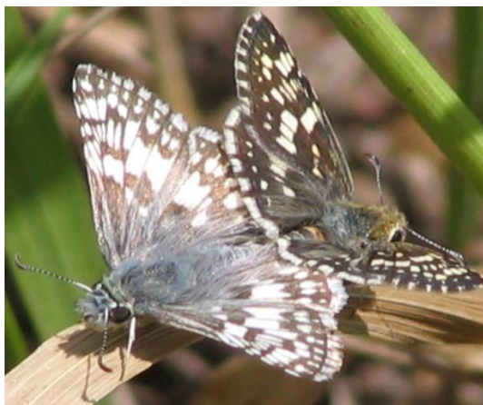
Common Checkered-Skipper (female left, male right)