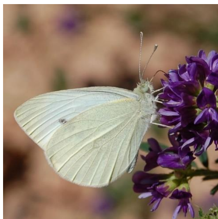
Cabbage White Dan Fosco

Numerous in Southeast Buffer, Geer Watershed