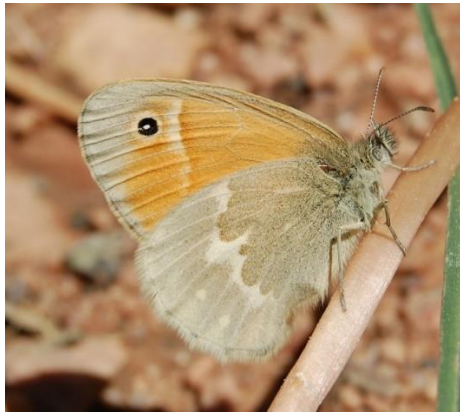
Ochre (Common) Ringlet Dan Fosco