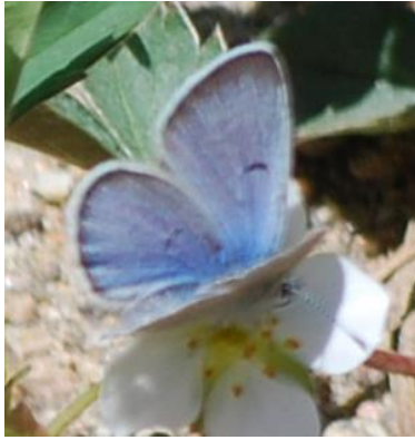
Greenish Blue (dorsal and ventral)

Both of the above species are numerous at Caribou and Reynold's Ranch.