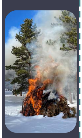
Slash pile burning at Caribou-Sherwood