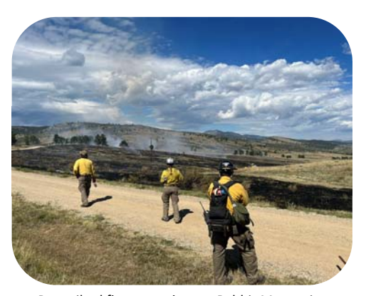
Prescribed fire operations at Rabbit Mountain

2022 ended up being an abnormal year. There were no seasonals workers in the Planning group. As a result not a lot of inventories were completed. Instead, staff focused on assisting other programs in the Forestry and Fire group. The sort yards also had a hard time finding seasonals so several shifts had to be covered by Planning staff. The summer was spent keeping ahead of the Sherriff's Office (SO) Fire Crew, with marking trees for their cutting project at Sherwood Gulch and overseeing multiple research projects on several properties.