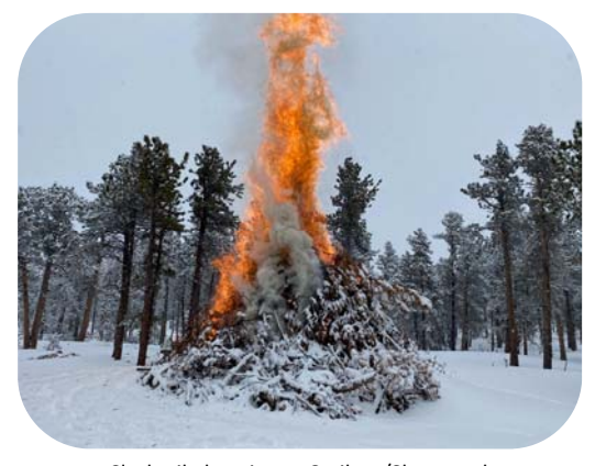
Slash pile burning at Caribou/Sherwood