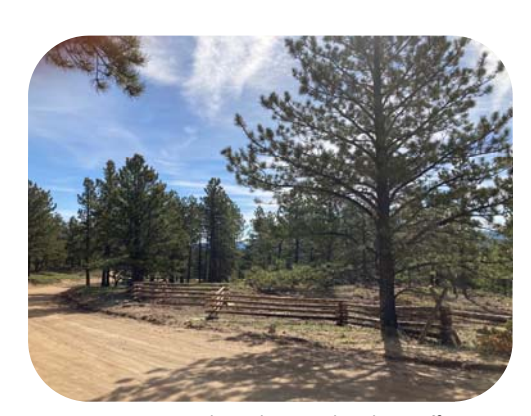
Fencing at Caribou-Sherwood to deter offroad use

Final touches were completed on the Caribou-Sherwood contracted forestry work.