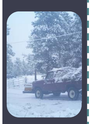
Opening Day at the Neder land CFSY

The total load count for 2022 was 8,874 loads, the second highest load count for a season. There were 423 new property locations in 2022 (213 from Meeker Park and 210 from Nederland). In total, there were 1,979 different property locations, with an average of 4.5 loads per property.