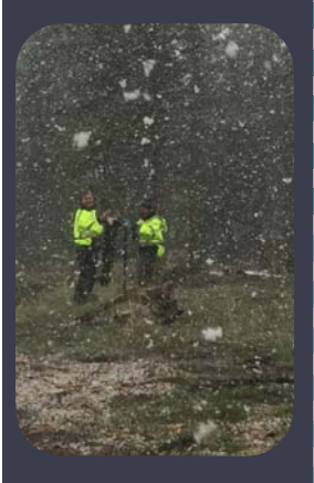
CFSY staff hanging Ips traps for the season

Education and outreach are a large part of the program. Unfortunately, there were no Wildfire Awareness Days at either yard because there was no seasonal staffing. We were able to continue a monthly newsletter, handout brochures, and managed a twitter account.