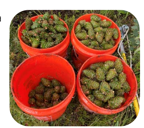
Limber pine cone harvest from Cardinal Mill-