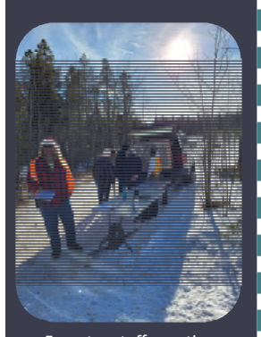
Forestry staff greeting holiday tree participants