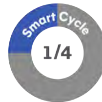
Split Cycle (Egg & Embryo Freezing) When paired with IVF cycle