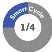
Purchase of Donor Sperm 4 vials