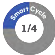
Timed Intercourse (TIC)