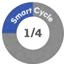
Intrauterine Insemination (IUI)