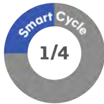
Frozen Embryo Transfer (FET)