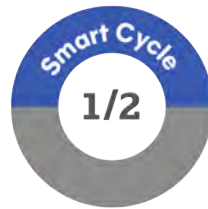
Frozen Oocyte Transfer (FOT)