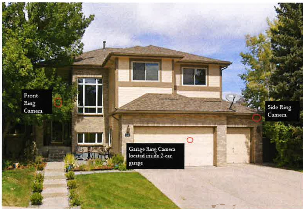
Location of Ring Cameras at the Residence

The Residence is equipped with three Ring security cameras labeled “Front” “Garage” and “Side.” The camera labeled “Front” is a doorbell camera next to the front door. The camera labeled “Garage” is mounted inside the garage on the back wall. The camera labeled “Side” is a camera mounted to the exterior of the home on the southeast corner of the garage, overlooking the driveway of the Residence. Video clips from these cameras from October 22, 2023, have been provided and reviewed.