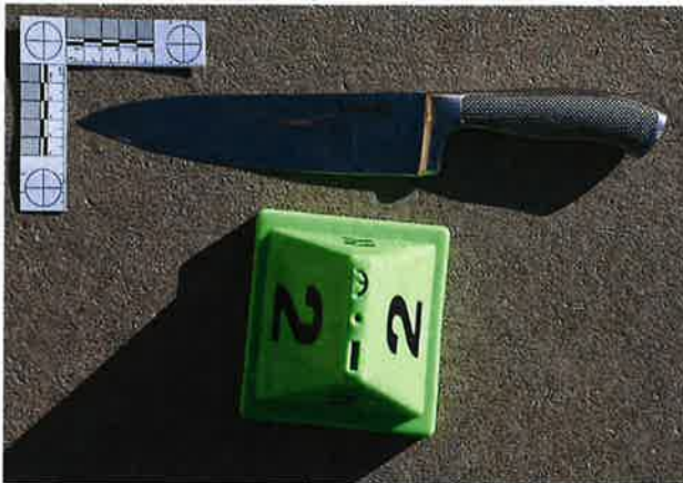
Kitchen knife found in driveway

An initial view of the scene revealed two large kitchen knives laying in the center of the driveway and bloodstains and medical debris in the grass where Mr. Wood collapsed. On the driveway where the attack occurred, large amounts of bloodstains, medical debris, a pair of handcuffs, a first aid kit, and two fired bullet fragments were documented. Additionally, there were two fired cartridge cases on the driveway, one on each side of a Ford Explorer that had been parked in the driveway.