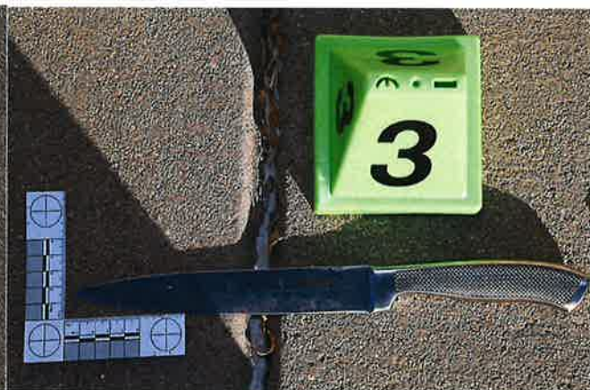
Kitchen knife found in driveway