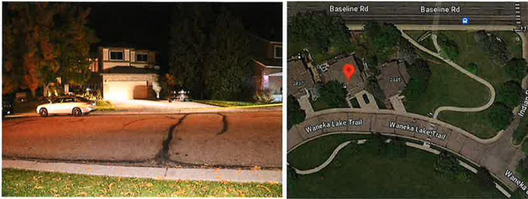
2441 Waneka Lake Trail on October 22, 2023

The Residence is equipped with three Ring security cameras labeled “Front” “Garage” and “Side.” The camera labeled “Front” is a doorbell camera next to the front door. The camera labeled “Garage” is mounted inside the garage on the back wall. The camera labeled “Side” is a camera mounted to the exterior of the home on the southeast corner of the garage, overlooking the driveway of the Residence. Video clips from these cameras from October 22, 2023, have been provided and reviewed.