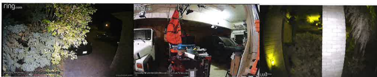
Side Ring Camera View