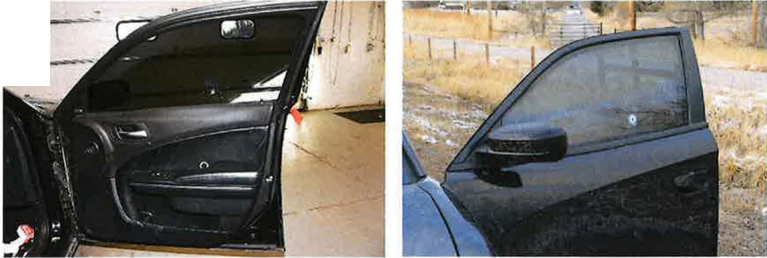
Photographs of the defect in Mr. Inda's Dodge Charger front passenger window that was noticed by Corporal Ziadeh when he first pulled up behind Mr. Inda's Dodge Charger.

There was also a defect located in Mr. Inda's front passenger side window. On further inspection, there was no damage or glass located inside of the Dodge Charger. Based on training and experience, Colorado Bureau of Investigation ("CBI") Agent-In-Charge Slater stated, "it appeared to me the defect was caused by a bullet that has been fired from a gun inside the car and that bullet traveled through the passenger window and exited outside the car."