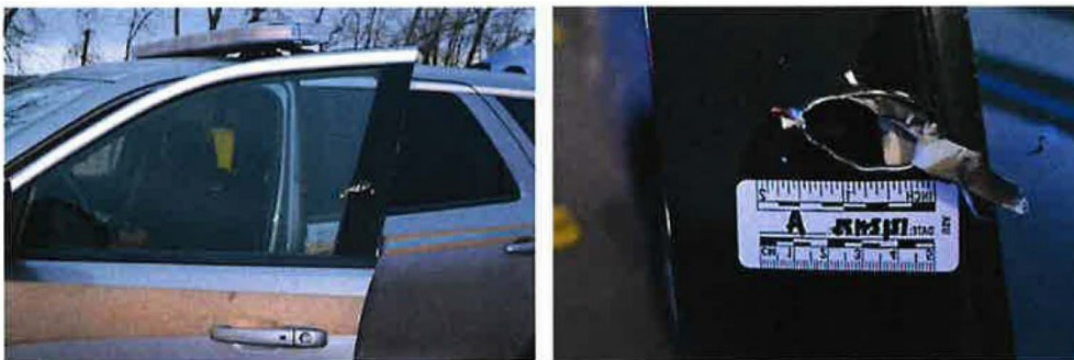
Photographs of the defect in front driver's side of the CSP vehicle.

On scene, a total of fourteen spent 9mm shell casings stamped with WIN 9mm LUGER +P, as well as three less lethal shotguns shells were located around, behind, and on top of the law enforcement vehicles parked on scene. These shell casings were consistent with the ammunition used by the law enforcement officers. Additionally, pieces of less lethal rounds, including two bean bags were collected. BCIT noted a defect in the CSP vehicle that appeared to be a bullet hole with a trajectory from behind the open door, where law enforcement took cover, towards Mr. Inda's car.