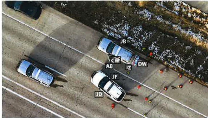
Diagram showing where officers were located during the shooting in relation to Mr. Inda's vehicle (upper left-hand corner)- cones and scene markers note the locations of casings and other evidence.

Members of the BCIT processed the scene where this incident occurred as well as Mr. Inda's Dodge Charger. Photographs and video were taken before evidence was collected. Members of the team generated an overlay of a scene photograph showing where the officers and relevant pieces of evidence were located during and after the shooting.