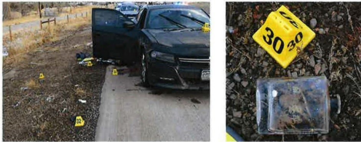
Photo of Scene showing location of handgun (32) and empty liquor bottle (30).

Near Mr. Inda's body, BCIT located an empty tequila bottle. BCIT additionally located a Ruger 9mm EC9S handgun with the serial number etched off near Mr. Inda on the side of the road. The Ruger 9mm's capacity was seven rounds in the magazine and one in the chamber. BCIT inspected the firearm and found four rounds.