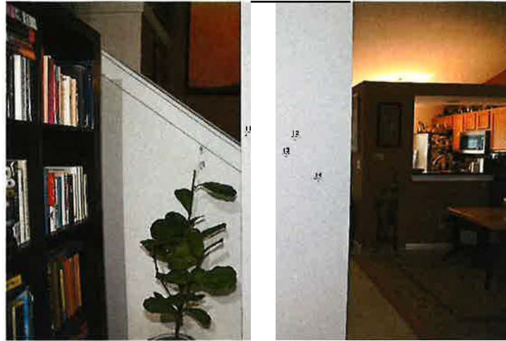
The bullet holes inside the residence are marked with crime scene numbers and show the tracking movement described by Officer Miller in his interview.

Investigators located six bullet holes in the column of the stairwell and the wall of the stairwell. An additional bullet trajectory was traced going through the kitchen and into the backyard, with the bullet lodging in the exterior wall of the residence behind 2184 Stuart Street.