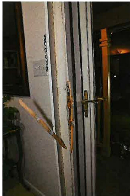
The door frame had damage to it caused by the officers' entry.