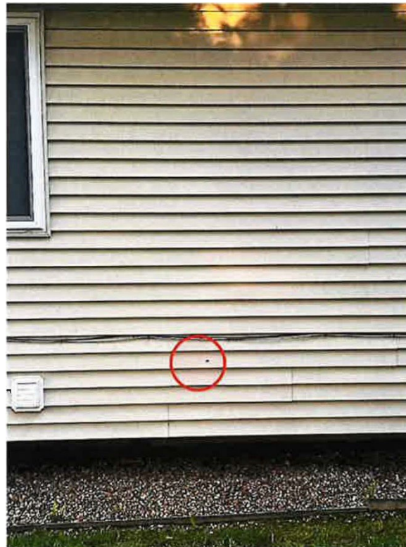
Bullet hole in exterior wall of residence behind 2184 Stuart Street.