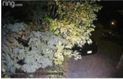
Side Ring Camera View