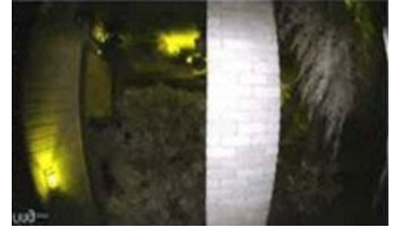
Front Ring Camera View