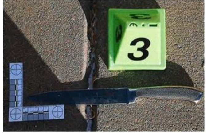
Kitchen knife found in driveway

A total of five casings were recovered from the scene which coincides with the video of the incident, the officers' interviews, and the round count from the officers' duty weapons, as further discussed below. Additionally, two bullet fragments were recovered and two fired bullet entry/exit holes through the small garage door were documented.