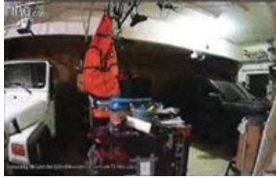
Garage Ring Camera View