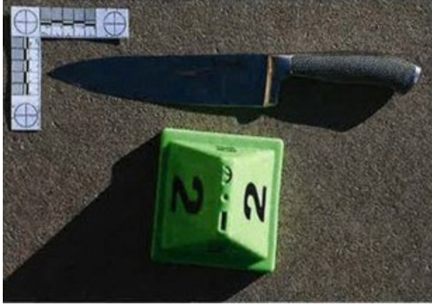
Kitchen knife found in driveway.