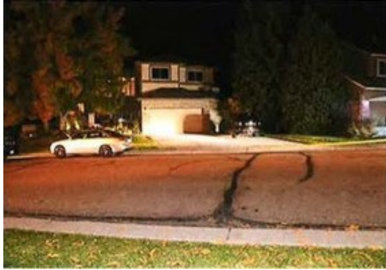
2441 Waneka Lake Trail on October 22, 2023