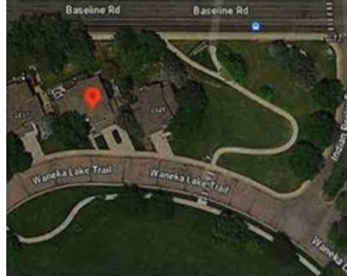
Overhead view of the property

The Residence is equipped with three Ring security cameras labeled "Front" "Garage" and "Side." The camera labeled "Front" is a doorbell camera next to the front door. The camera labeled "Garage" is mounted inside the garage on the back wall. The camera labeled "Side" is a camera mounted to the exterior of the home on the southeast corner of the garage, overlooking the driveway of the Residence. Video clips from these cameras from October 22, 2023, have been provided and reviewed.