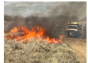
Agriculture burning at Doniphan