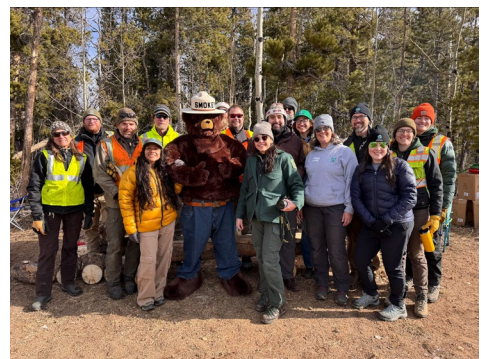
Staff photo with Smokey