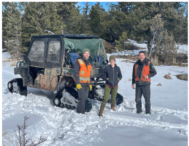
Staff working at project location in winter