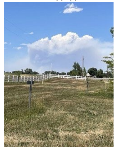
Stone Canyon fire smoke plume