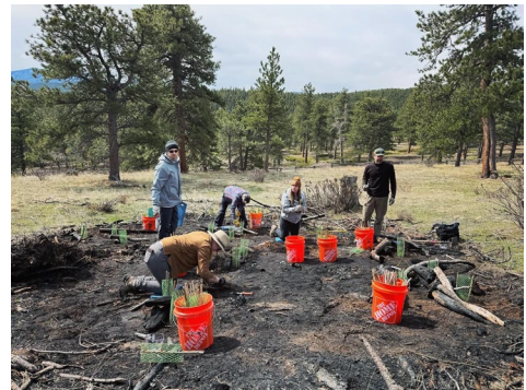
Volunteers plant limber pine seedlings.