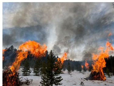
Slash piles burning at Reynolds Ranch