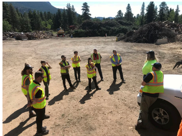
Biomass operations tour group