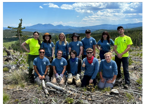
Youth Corps team