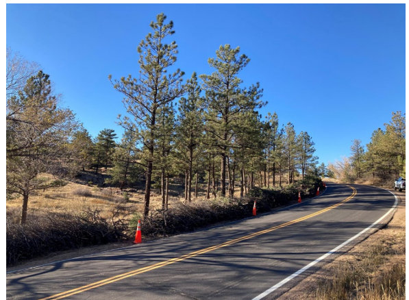
Forsberg/Blue Mountain Road