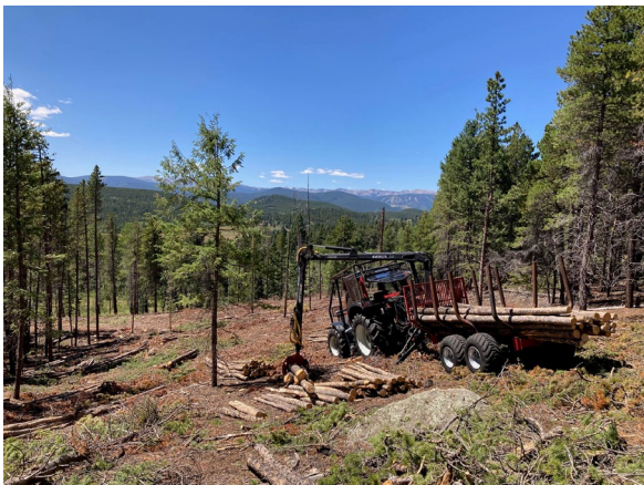
Reynolds Ranch PA1U3