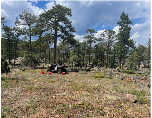
Slash piles at Riverside Ranch