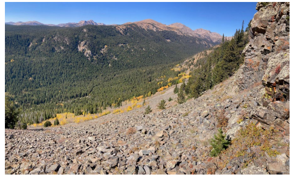
Rocky Mountain bristlecone, Forrest property