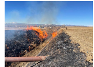
Agriculture burning at Faul