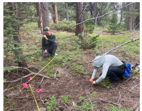
Understory data collection