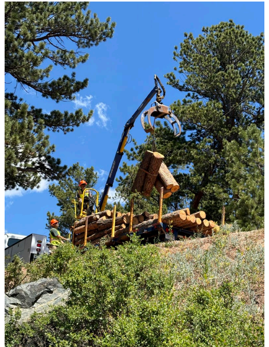
Overland yarding operations