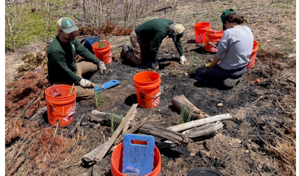
Limber pine planting, Reynolds Ranch