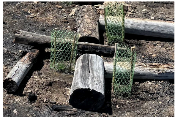
Limber pine seedlings, Reynolds Ranch