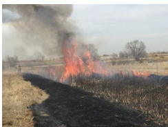
Agriculture burning at Wittemyer