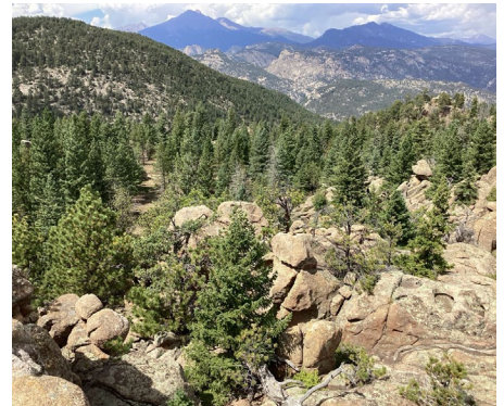
Riverside Ranch after treatment