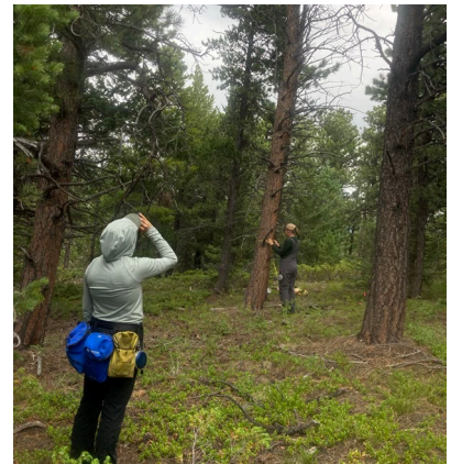
Overstory data collection