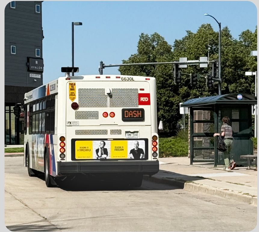
The Lafayette Park-n-Ride has transit service throughout the day and includes shelters to wait for your bus.

“It would be great if things ran more often and more reliably. I took the [BOLT] every day for years working in Boulder and the lack of reliability was very stressful, especially getting home. I go to both Louisville and Fort Collins for work now and can bike/bus/bike, but the limited schedule to Louisville is tricky.”